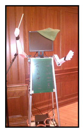
Figure 1. Conducting humanoid robot Link.

number in the top left corner of the screen shows the current measure, the bottom left corner displays the time signature. The graphical bar on the right represents the dynamic level, with low-fill for soft and high-fill for loud.