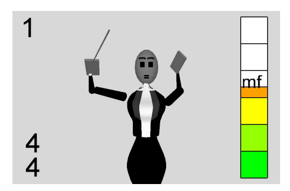
Figure 2. Humanoid conducting animation Roxy.

Carmen (shown in Figure 3) is a non-humanoid animation that represents conducting information through a variety of colored rectangles, with each color corresponding to a different instrument being played. The left side of the screen shows dynamics (with higher bars corresponding to louder music). The right side of the screen is used for cueing: bars drop down over the measure before the entry measure. The border flashes from white to black on the downbeat.