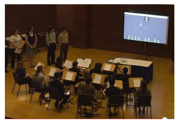
Figure 5 . Two artificial conductors conducting a dectet of human musicians. Top: humanoid robot Link, Bottom: Non-humanoid animation Olmec.