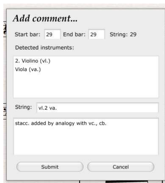
Figure 4. The dialogue presented when adding a comment. Information about the affected instruments and the position has been automatically filled in based on the current selection in Sibelius.

Sibelius allows for mapping plug-ins to user-defined keyboard shortcuts. This is utilized to achieve tight integration with Sibelius. When the defined keyboard shortcut is pressed, the command file is changed, causing the respective dialogue to pop up in front of Sibelius. The user selects a passage in the score, then clicks the keyboard shortcut. This causes the "Add Comment" dialogue to pop up, with bar and part information already filled in, as can be seen in Figure 4. The interface for editing individual comments in the score has a similar design. The web interface is de-