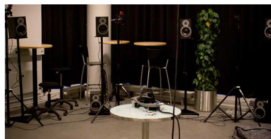
Figure 2. The Multisensory Experience lab at Aalborg University in Copenhagen

The experiment has been carried out in the Multisensory Experience Lab of the Sound and Music Computing group of Aalborg University in Copenhagen, see fig. 2.