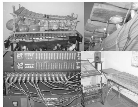
Figure 3. Top left: Gyl on top of vibraphone for showing scale, Top right: piezo sensors under bars, Bottom Left: 2882 input, Bottom Right: overview

The field of computational ethnomusicology is still in its infancy and most of existing work is exploratory. As the field matures it can play an increasing role in addressing long standing musicological questions. This will require more active involvement of musicologists who can formulate hypotheses that can then be tested empirically through computational analysis. The majority of existing work in CE (and MIR for that matter) is centered around processing collections of audio recordings. An audio recording consists of the mixture of a number of individual instru-